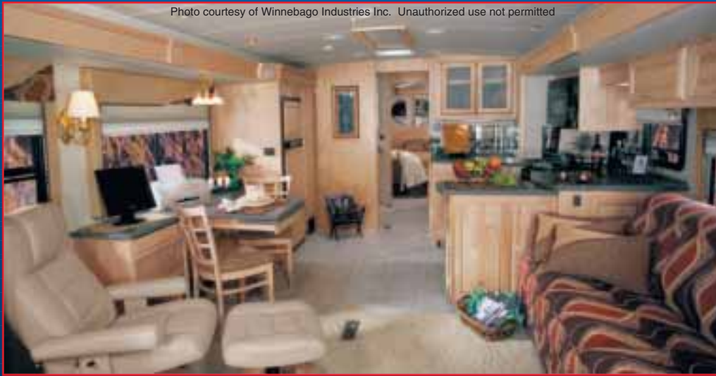
Photo courtesy of Winnebago Industries Inc. Unauthorized use not permitted