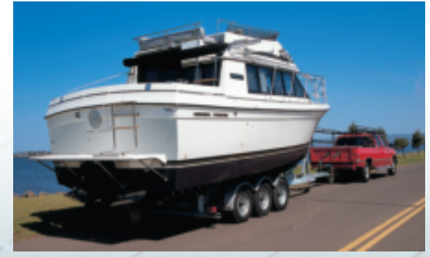
AMSOIL ATF withstands even the toughest towing demands.