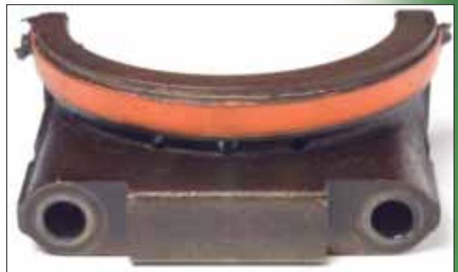
The rear main bearing cap and oil seal were in good condition. The rear seal was very pliable and still in tact, showing no signs of deterioration.