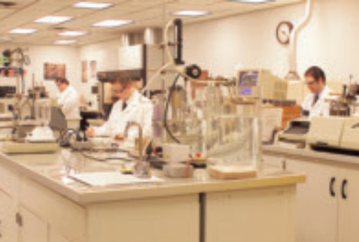
See your nearby AMSOIL Dealer today!